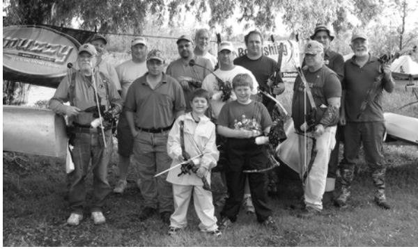
Greetings from Lake Lonely