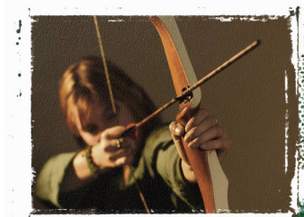
The Field Committee

Congratulations to all our top archers. The engraved awards will be presented at our October meeting. We look forward to even more good times in 2013.